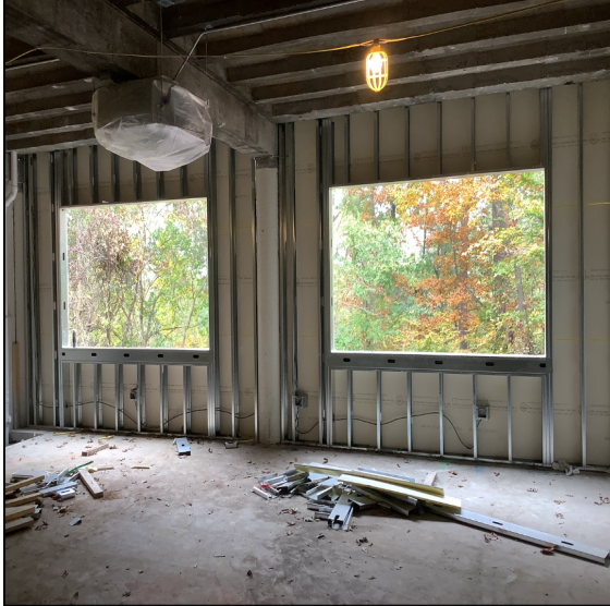
Continue interior furring wall install