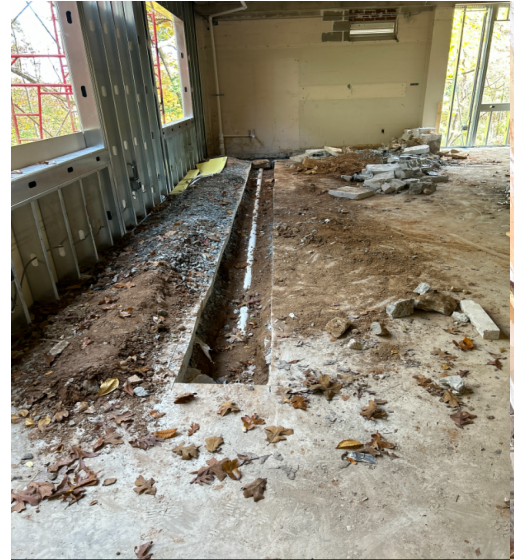
In route to begin underground trench pour back