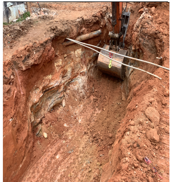
Removing and Relocating Sanitary Sewer lines to begin kitchen addition building pad.