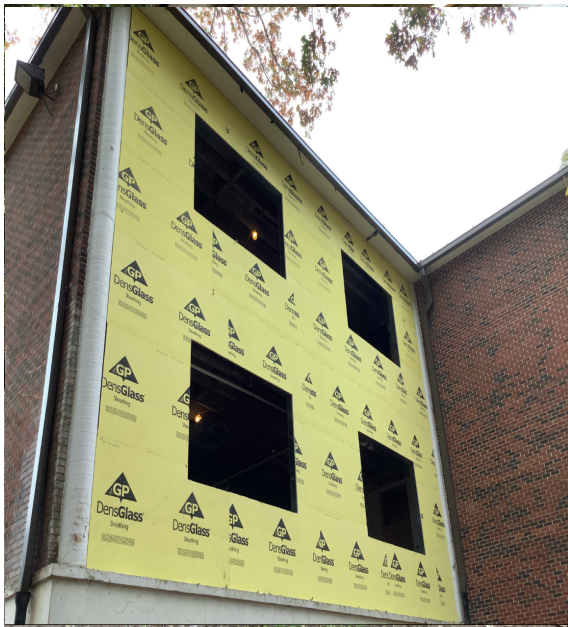
Continue to installing Sheathing at the 1928 building